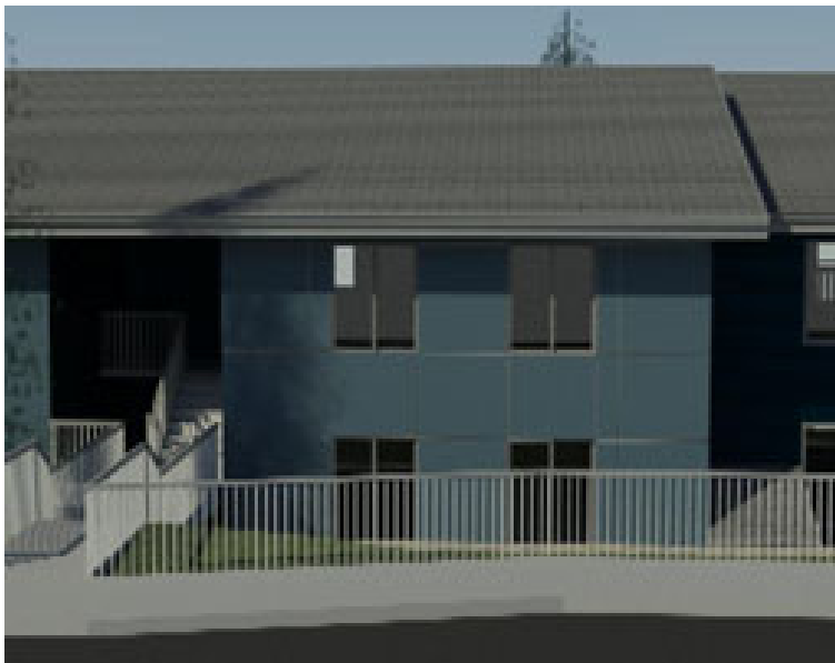
Parking Lot Side