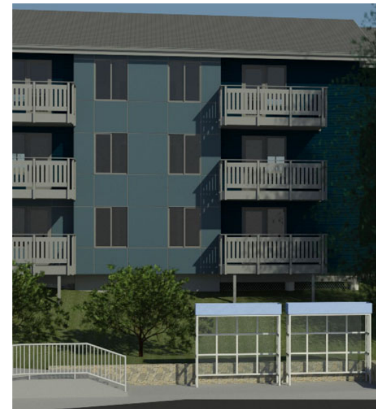
Bill McDonald Parkway Side