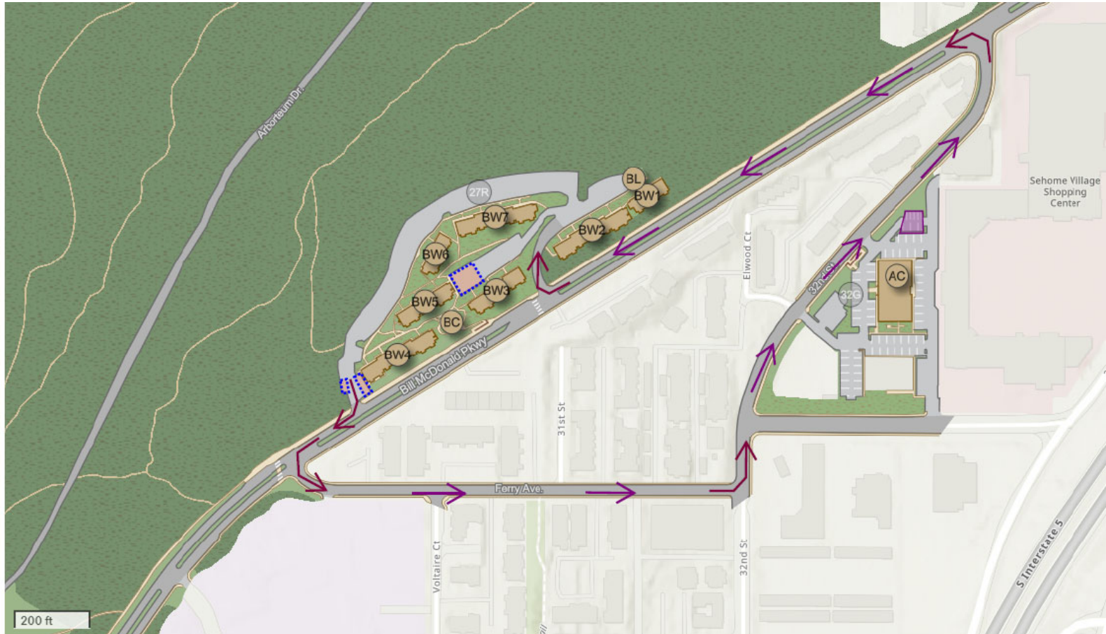
PW778A BW SIDING AND BRIDGES PHASE 1 - EXPECTATIONS AND IMPACTS 32ND STREET OVERFLOW PARKING