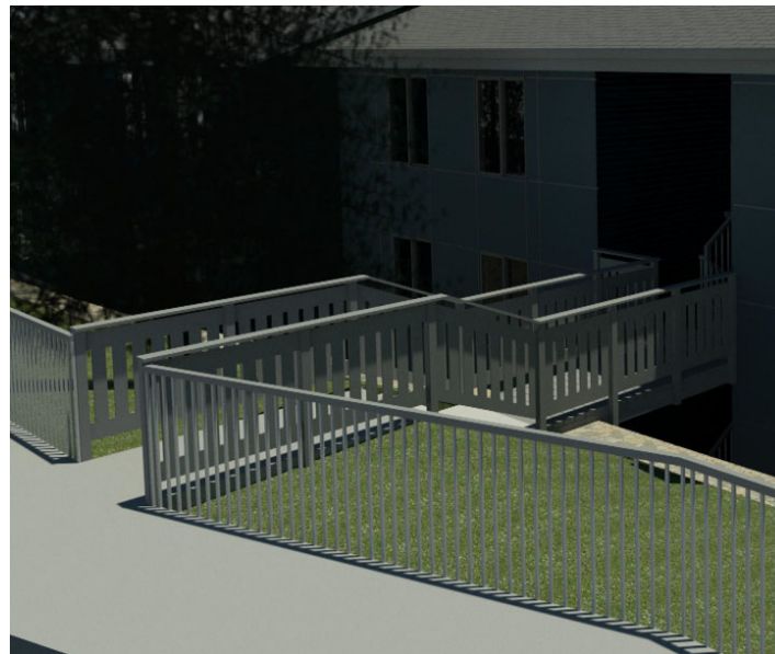
View Of Bridge