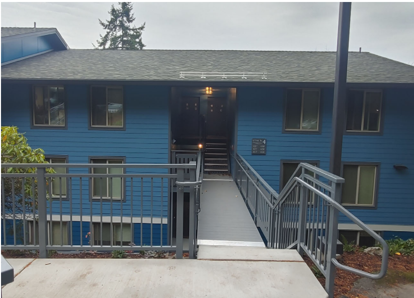
Parking Lot Side