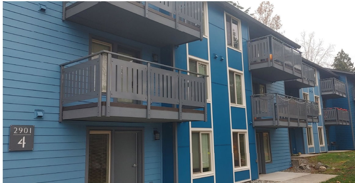
Bill McDonald Parkway Side