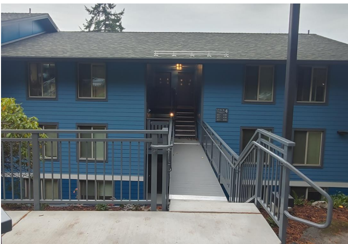
Parking Lot Side