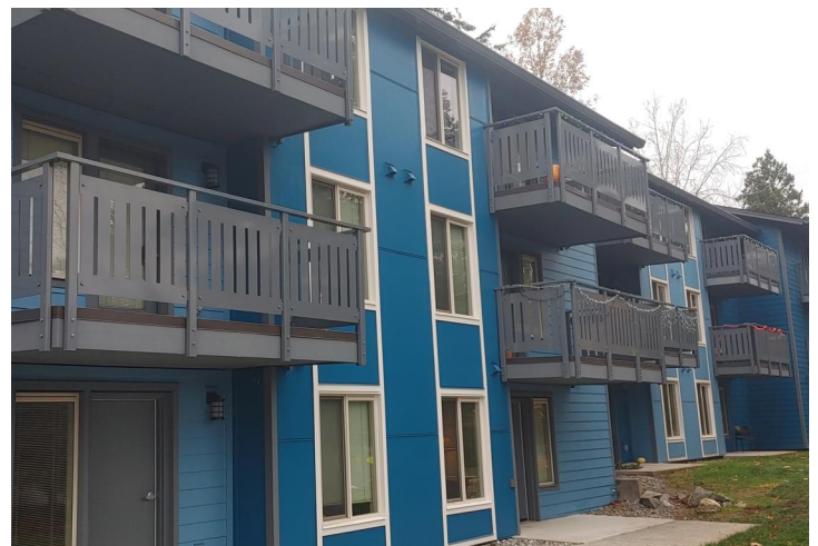
Bill McDonald Parkway Side